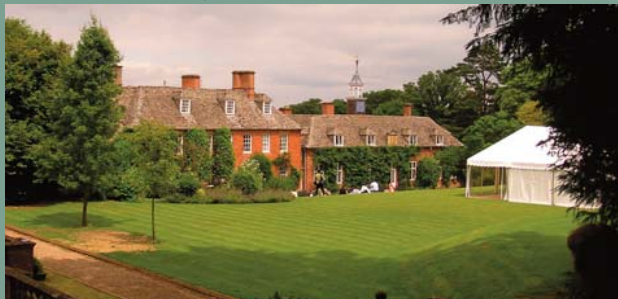
View of Burnt Norton July 2009

The Institute hosts a portfolio of research programmes and provides postgraduate teaching and training in this research environment. It also hosts the National Research Training Scheme in English Language, Literature, Palaeography and the History of the Book.